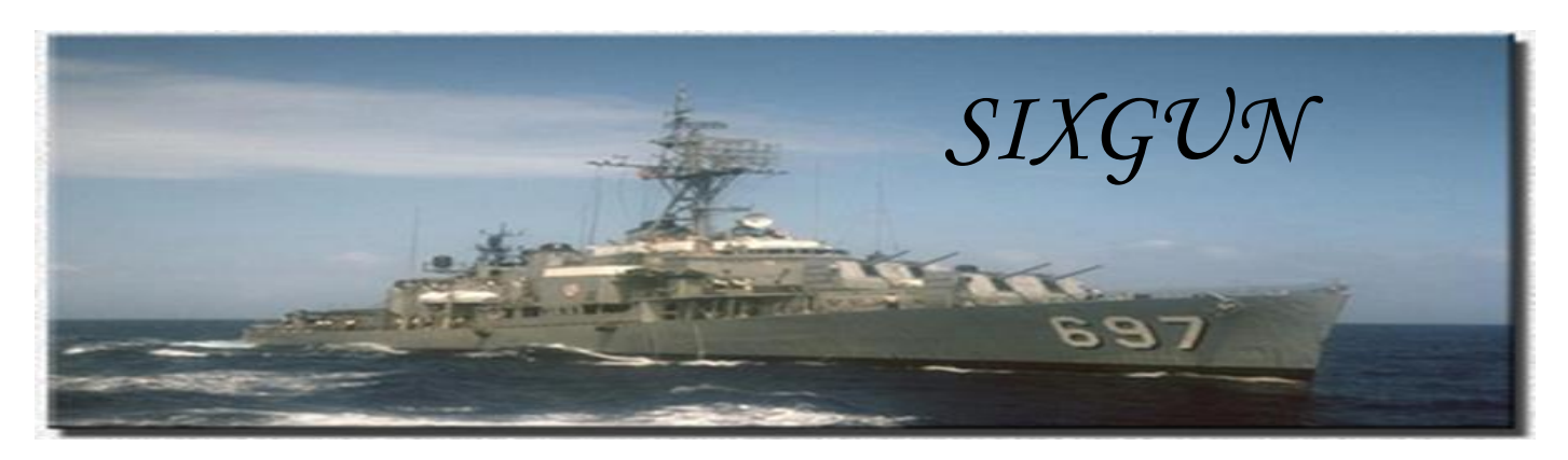
Official Newsletter of the USS Charles S. Sperry DD 697 Association